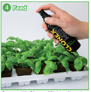
Spray with Clonex Mist until roots develop, then feed with Clonex Clone Solution