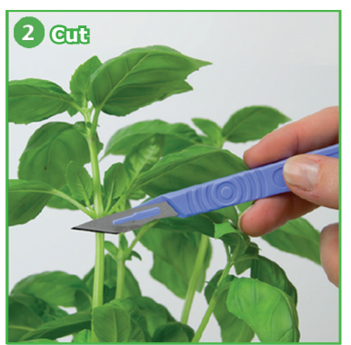
Make a sharp diagonal cut below a leaf node