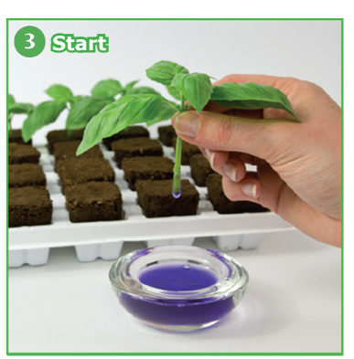
Dip cutting into Clonex Rooting Gel then straight into Root Riot cube