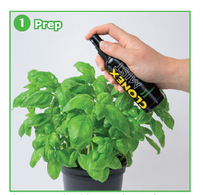
Spray mother/donor plant a few days before taking cuttings